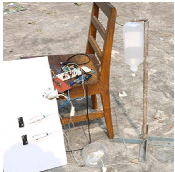
Fig. 1. Automatic IV fluid feed system

IV chord is connected to the needle and other part of the chord is connected the main line. By flowing through the line, pa-